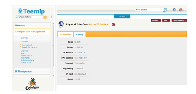
Detail of an IP interface

The CMDB allows you to document as well all your contacts (teams and persons) together with their roles and responsibilities.