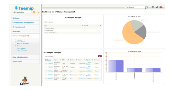
Repport on open tickets